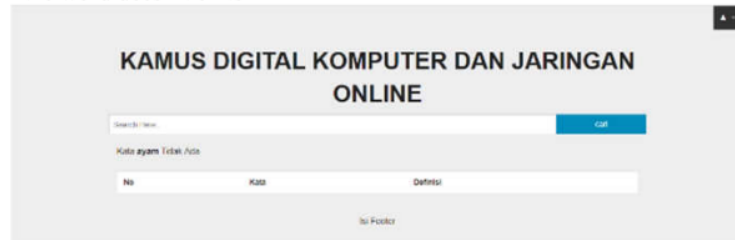
Figure 3. Search result if the word doesn't exists

Search result if the word doesn't exists