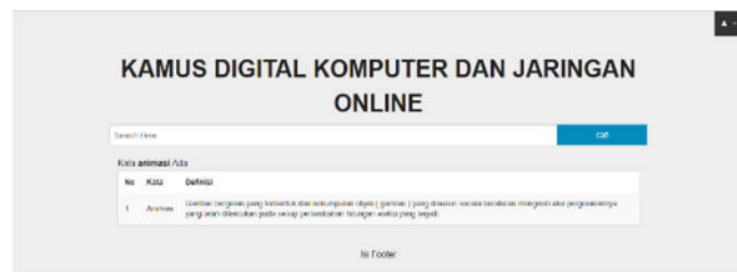
Figure 2. Search result if the word exists