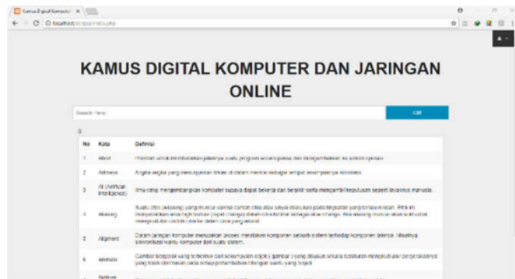
Figure 1. Main Page